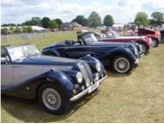
Detling and Valentine dinner

I would like some feedback and perhaps some discussion about insurance after this request from a member. It's that time of year again and in three weeks the insurance is due for my 11 year old, 2.4 V6 Sabre. So it's with the greatest respect I'm requesting your feedback on insurance premiums. I appreciate premiums are based on an individual's circumstances and I don't wish for any personal information, but if you don't mind I'd be interested to know what are typical rates and who might be providing the best cover/deal in these constricted financial times. Currently, with my insurer (Glynwood based in Staffordshire) I'm covered fully comp, full NCD at £230 but for only 2000 miles per year. (I have another car and a motorbike, but I can't find a mainstream insurer - the type that do multi-vehicle deals - who will cover a self-build car.) Thanks, and I look forward to any replies.